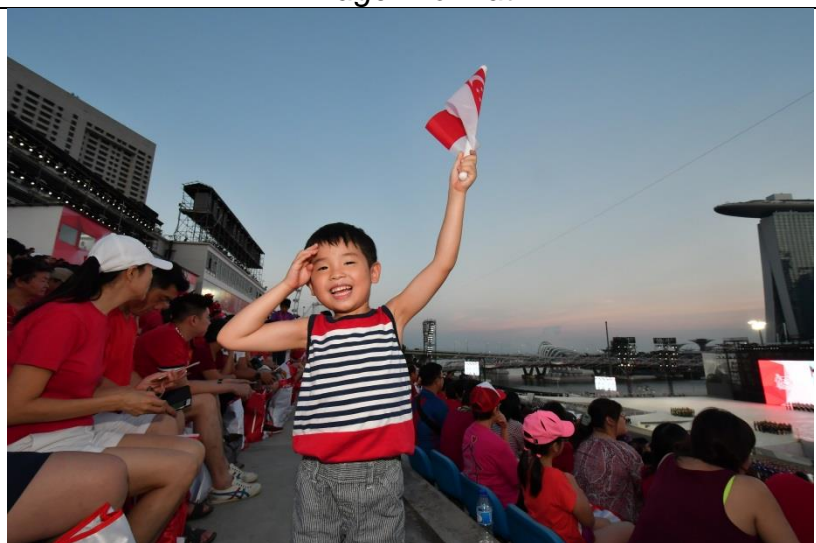
Image: Salute to the nation