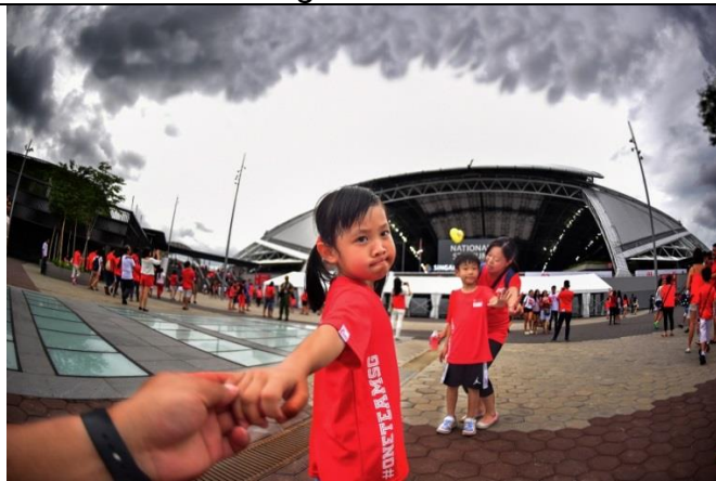
Image: Our generation to next

SAFRA Photographic Club Committee Member