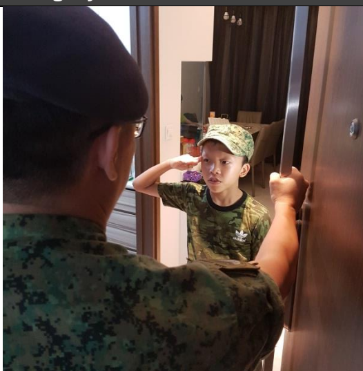
Image: Coming Home