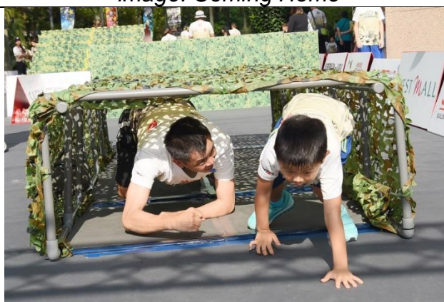
Image: Father and Son